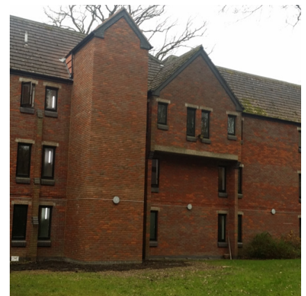
Lift shaft at rear of building