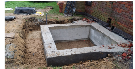
Concrete pit under construction

JBA worked closely with A2Dominion on the project from inception through to completion, liaising with the client, builder, lift contractor, design team and scheme manager, to minimise disruption to residents and bring the new lifts on stream as quickly as possible.