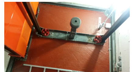
Finished concrete pit